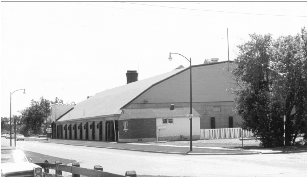
Plate 2 – The Granite Curling Club, 22 Mostyn Place, 1970.