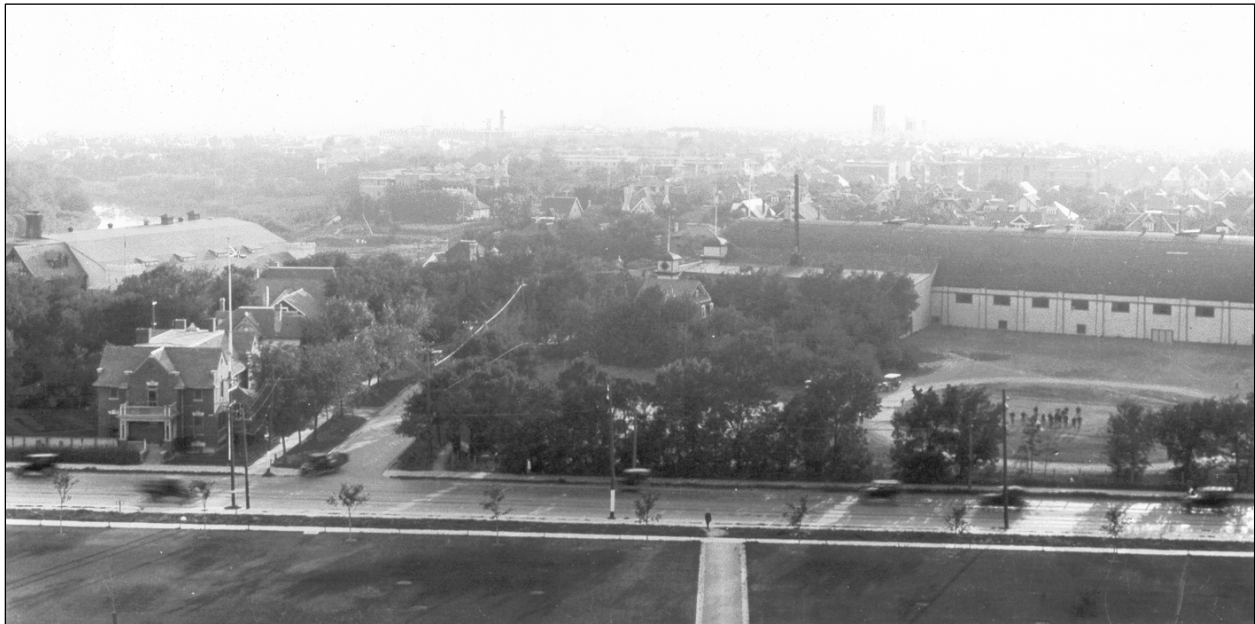
Plate 4 – Taken from the top of the Legislative Building, this shot shows the roof of the Granite on the far left and the massive Winnipeg Amphitheatre on the right, 1926.