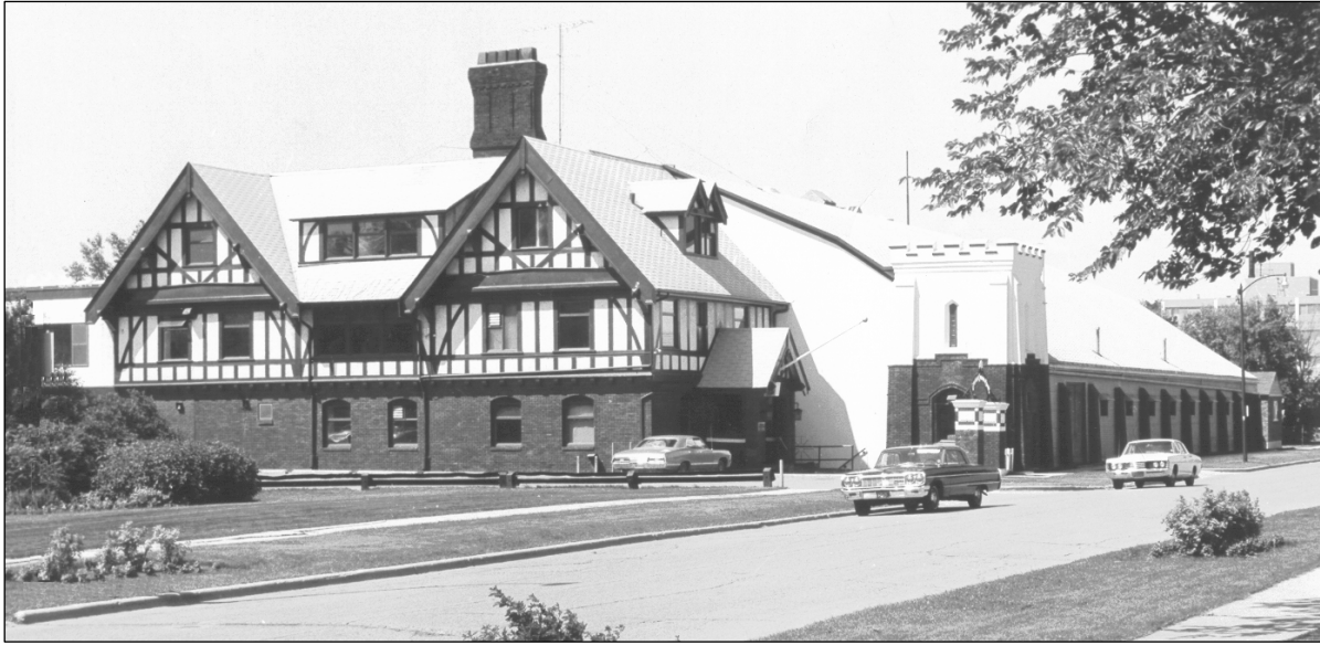
Plate 1 – The Granite Curling Club, 22 Mostyn Place, 1970.